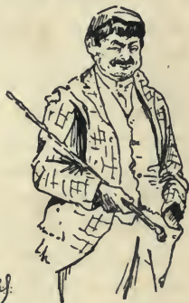
MY FRIEND SLIPPER

"Begor, I don't know no more than your honour. And Shreelane—that there used to be as many foxes in it as there's crosses in a yard of check! Well, well, I'll say nothin' for it, only that it's quare! Here, Vaynus! Naygress!" Slipper uttered a yell, hoarse with whisky, in adjuration of two elderly ladies of the pack who had profited by our